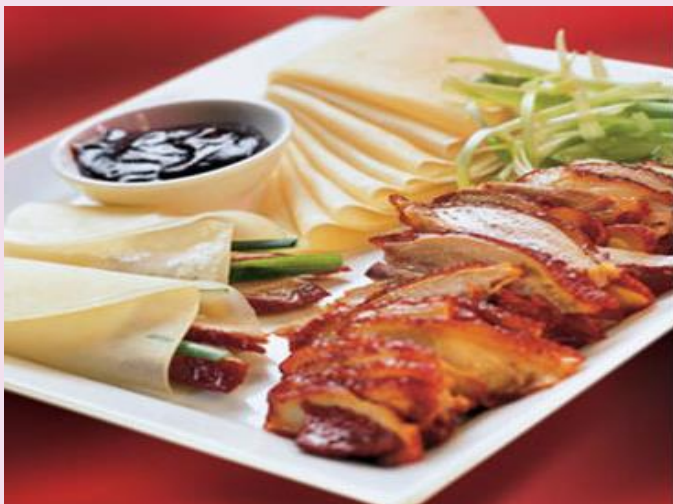
Beijing Duck (北京烤鸭)

Besides the Beijing Duck, there are other dishes like Jingjiangrousi (京酱肉丝), Zhajiangmian (炸酱面), donkey burger (驴肉火烧) and dumplings that can be found at across Beijing – at almost every single Chinese restaurant you go to!