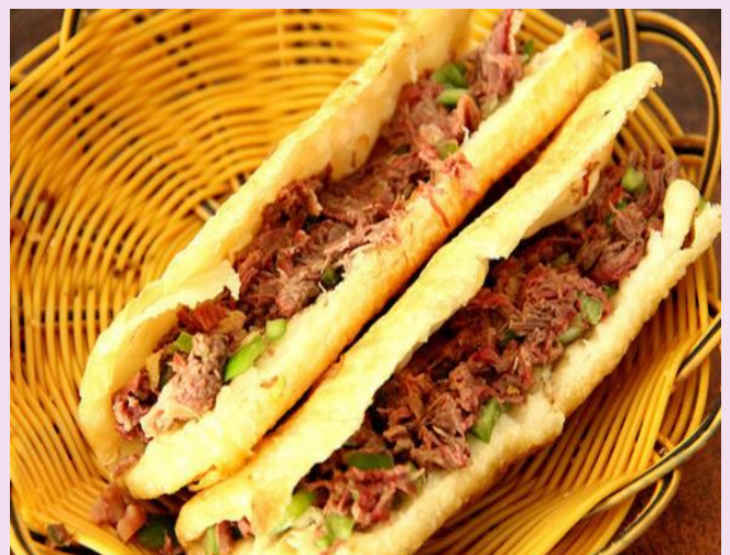
Donkey Burger (驴肉火烧)